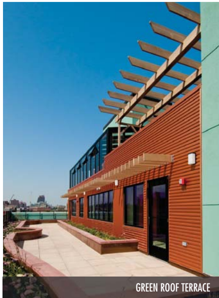
GREEN ROOF TERRACE

Environmentally responsible design has been integral to the building design which exhibits both passive and active energy-saving methods. The building anticipates receiving the Energy Star Building Label, as certified by NYSERDA.